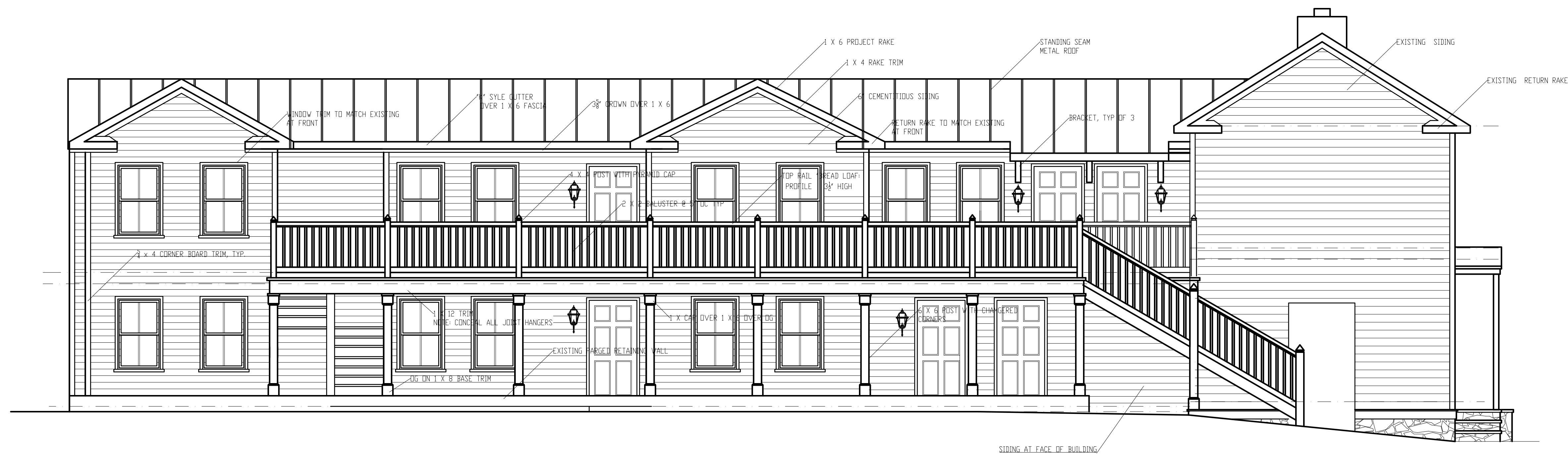
PROPOSED LEFT SIDE ELEVATION