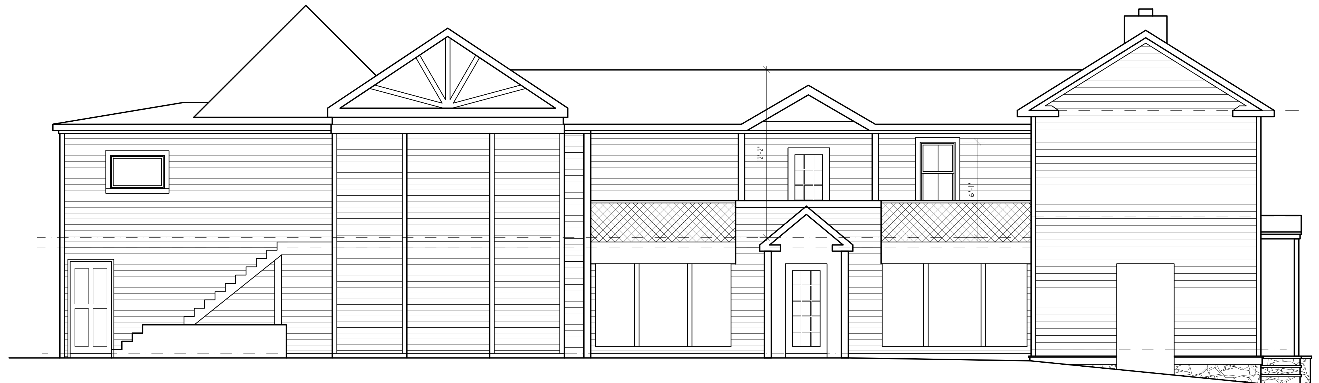
EXISTING LEFT SIDE ELEVATION