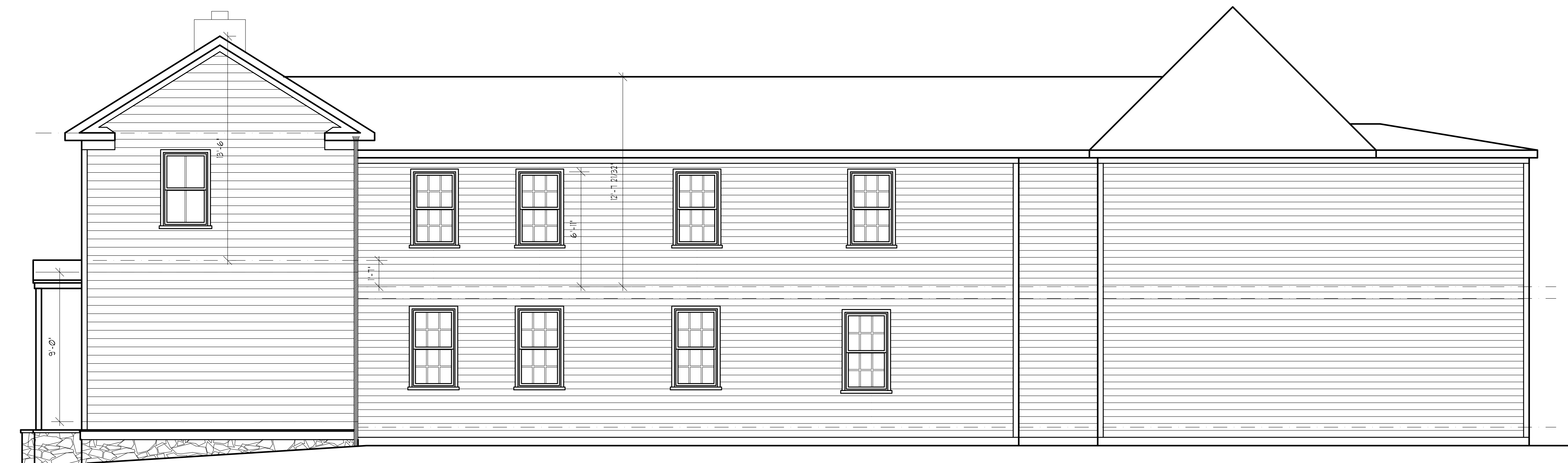
EXISTING RIGHT SIDE ELEVATION